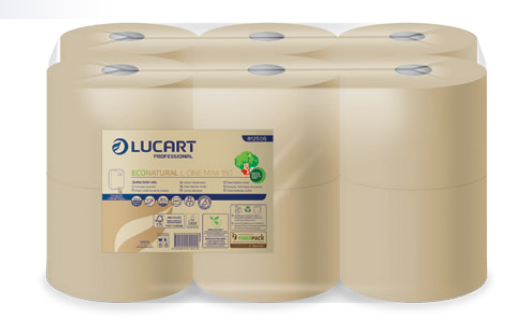
L-One Mini Dispenser

The Toilet Tissue That Delivers a Single Sheet Every Time. Save Paper, Save Storage, Save Money Code 812506 12 roll x 180 metre per roll 2 ply, 800 sheets per roll